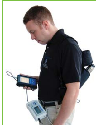
FM-801 (on optional ACC-BELTCL-1 belt clip) shown connected to GrayWolf AdvancedSense™