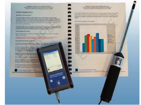
WolfSense ARG report

WolfSense PC software allows logged data to be down-loaded to your PC for review, graph generation, cut & paste reporting and/or simple export to Excel