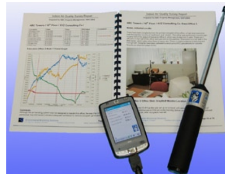
WolfSense ARG report

WolfSense PC software allows logged data to be down-loaded to your PC for review, graph generation, cut & paste reporting and/or simple export to Excel